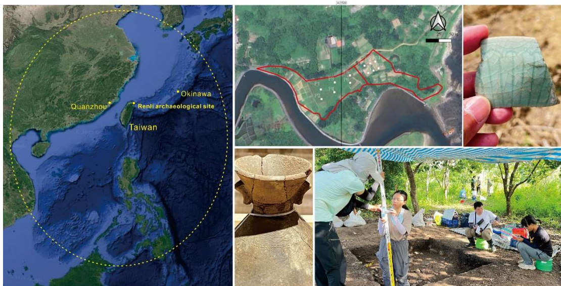
Figure 1 : The International Field School on Austronesian Archaeology at Renli archaeological site